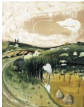
Above Brett Whiteley Marulan bird with rocks oil, mixed media and rocks on composition board 96 x 76 collection: Brett Whiteley Studio Museum

Toured by MGFNSW and Hazelhurst Regional Gallery