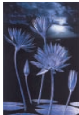
Above Robyn Stacey Surrender (Blue) 2000 type C photograph